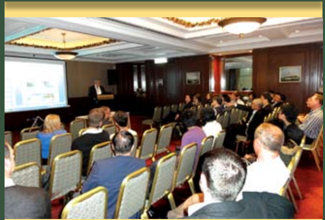
The seminar was well attended with over 50 members

of underground space in Hong Kong. He then provided an update of the major rock cavern projects in Hong Kong and worldwide since the Study of the Potential Use of Underground Space (SPUN) and benchmark the Hong Kong's practice with that elsewhere.