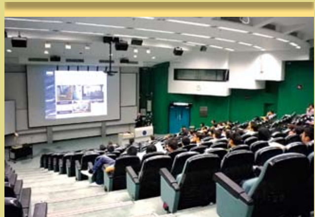
The seminar was well attended by 70 participants