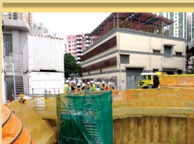
A delegation of 16 people attended the technical visit to DSD HATS Stage 2A, Contract No. DC/2007/23 in February 2011