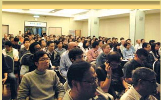
The seminar was very well attended with more than 300 members

Classifications have played an indispensable role in engineering for centuries. Rock mass classifications which have developed from civil engineering case histories form the back bone of the empirical design approach and are widely employed in rock engineering. The forum was aimed at exploring the role of rock mass classifications in site characterization and engineering design.