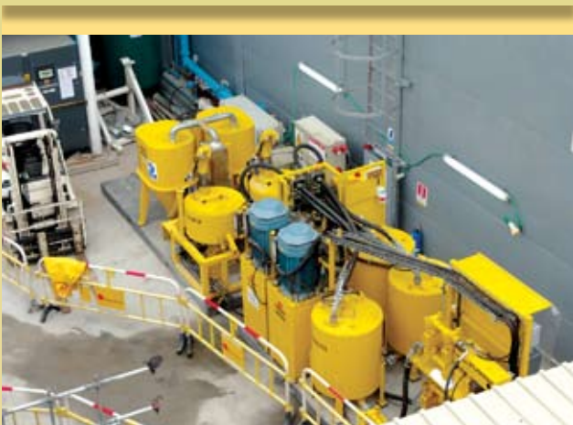
Multi-stage pumping station for grouting of rock shaft in the project