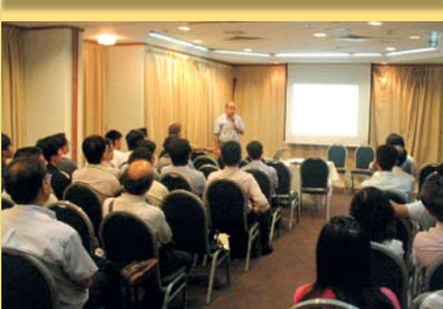
Over 50 members attended the seminar on “Advances in Instrumentation and Geotechnical Control” in September 2010