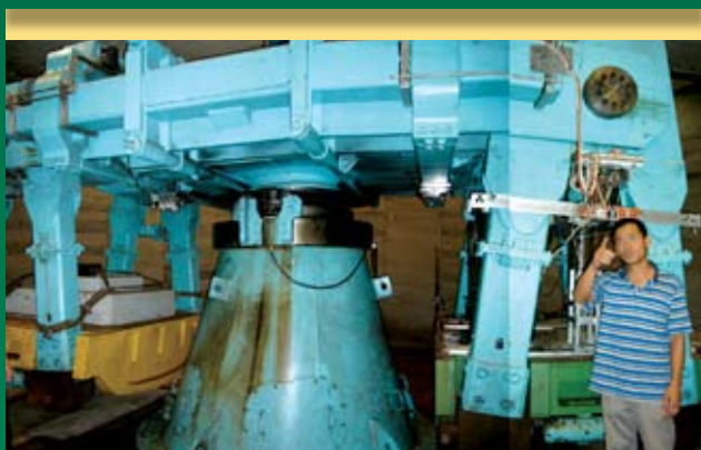
Geotechnical Centrifuge Facility at HKUST

The GCF is a powerful and advanced laboratory for physical modeling of various engineering related problems, such