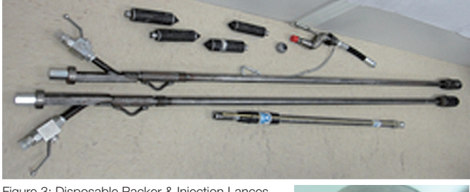
Figure 3: Disposable Packer & Injection Lances