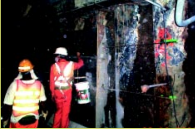
Vertical screed for casting of concourse wall