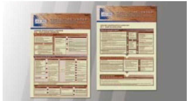
GIG04-6 and GIG04-7 were distributed to the profession in December 2004.

The AGS(HK) GIG Working Group recently issued two further Ground Investigation Guidelines; namely GIG04.6 Soft Ground Tunnelling and GIG04.7 Karst in Hong Kong. These two documents concluded the series (Chapter 4) on design guidelines. The next GIG will feature Supervision and responsibilities for SI operations and will cover statutory, professional and contractual issues. A supplementary guideline of practical site and equipment checks is also planned.