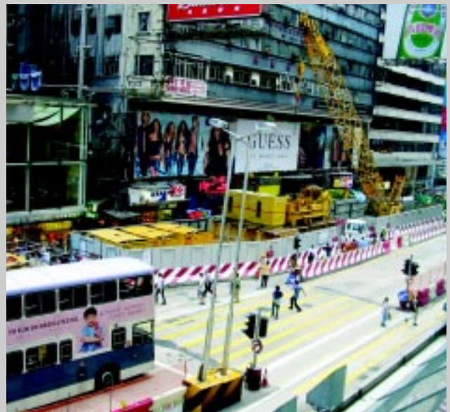
Nathan Road Site (viewed from the Hyatt Hotel).