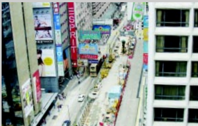
Congested Site at busy Nathan Road (viewed from the Sheraton Hotel).

The MTR Tsim Sha Tsui (TST) Station Modification Works involved deep excavation and pedestrian subway construction in a busy urban area. The excavation for the subway was as close as 1.5m above the crown of an operating MTR tunnel and the temporary retaining structures a similar distance from the side of the tunnels. The works were therefore associated with high risk. Risk management and mitigation became an extremely critical issue to the success of this project. The challenges and the experience gained in this project were discussed in this ground forum from three different perspectives.