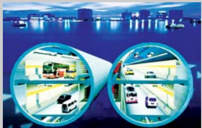
View of the largest tunnel under construction in Mainland China. 上中路隧道