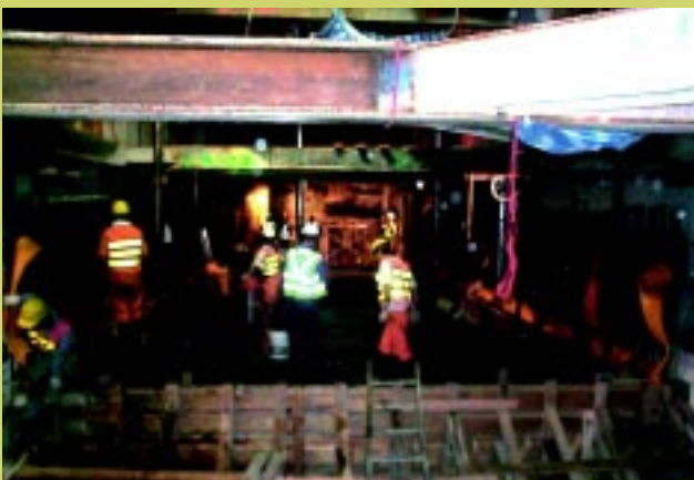
Casting concourse extension base slab below Nathan Road excavation (MTR Tsuen Wan Line Tunnel in close proximity below).

In the last presentation, Mr Phil Gunning reviewed the major risks. These are tunnel deformation, tunnel flotation if the cofferdam was flooded and building settlement. Regarding construction, Giken Press-In piling method and Gammon Closed Loop Pipe Pile System were chosen to install sheet piles and pipe piles respectively to minimize noise, vibration, ground disturbance and water ingress into the cofferdam. The Closed Loop System was also compared with the conventional Down the Hole Hammer. To prevent flotation and deformation of the existing tunnel, ballast was maintained above the tunnel at all times during excavation. Because of the high risk, extensive instrumentation was installed to monitor the tunnel and ground continuously. Despite the huge amount of data, spreadsheets were used to analyze the data automatically. A maximum tunnel deformation of 9mm (upwards) was measured at the tunnel crown and was less than the alert level of 12mm. Maximum building movement recorded was 4mm, which is satisfactory. Despite one flooding incident, the instrumentation indicated that trains can still operate safely in the tunnel. This highlights the importance of having adequate instrumentation, otherwise, the MTR tunnel might have to stop service during a very busy time. There were not many problems and the work was finished ahead of schedule.